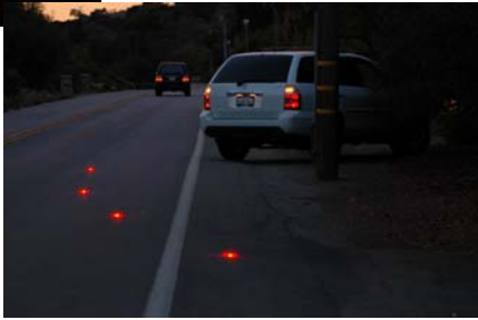
PowerFlare lights deployed on road for traffic control