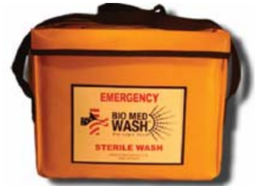
Soft Sided Bag -15 Pack-