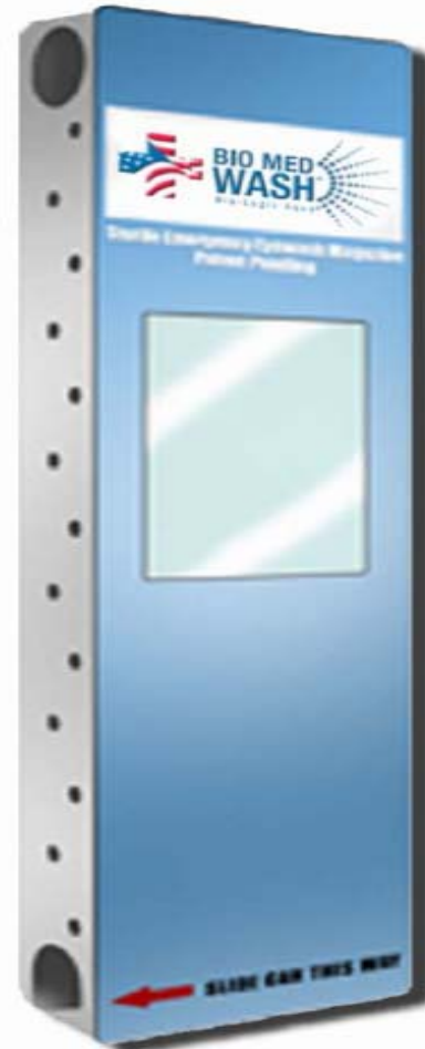
Eye Wash Magazine - Wall Dispenser -